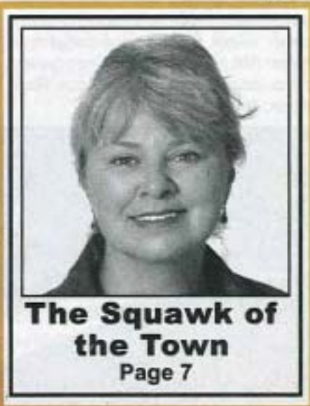
The Squawk of the Town Page 7